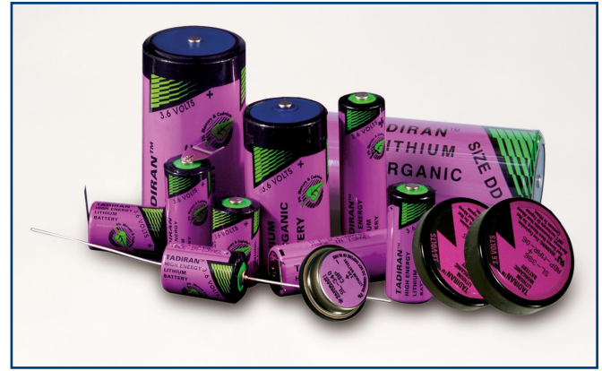
Lithium Thionyl Chloride (LTC) Batteries

e-mail: info@tadiranbatteries.de www.tadiranbatteries.de