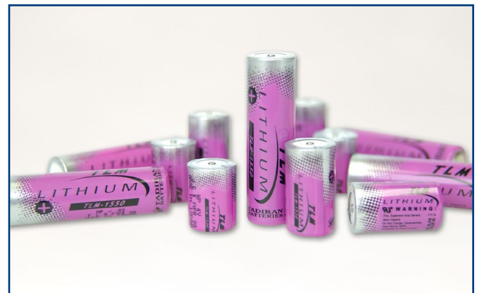
TLM High Power Batteries